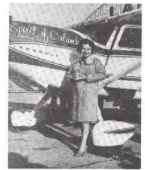
Mrs. Jerrie Mock on March 19, 1964 at Port Columbus before leaving for her historic round the world flight.

The September meeting was a tour of the Industrial Nucleonics ..... Accuray, bought out by Combustion Engineering, bought out by ABB.) The October meeting was a joint meeting with the Chapter, OSPE and the Auxiliary with the speaker Mrs. Jerry Mock. Two certificate presentations were held, one at the