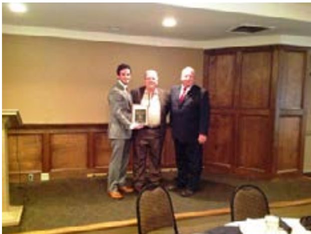
ms consultants, inc