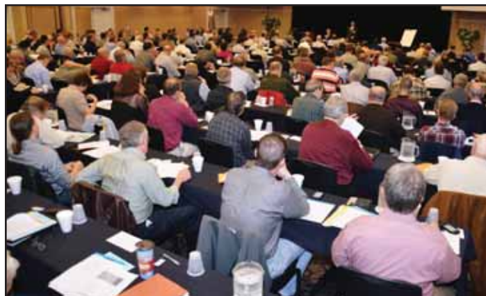
The Fall CPD Conference was well attended and highly successful as evidenced by glowing remarks on evaluations.